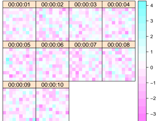
Figure 3: spplot for an object of class SpatialTimeGridDataFrame , filled with random numbers.

The reason to only convert back to SpatialTimeGridDataFrame when multiple time steps are present is that the time step (“cell size” in time direction) cannot be found when there is only a single step. In that case, the current selection method returns an object of class SpatialPixelsDataFrame for that time slice.